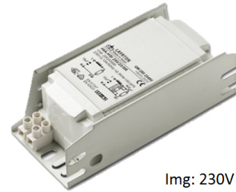
Img: 230V 50Hz