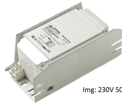
Img: 230V 50Hz